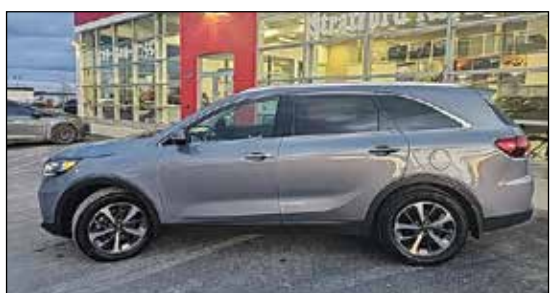
2020 Kia Sorento EX

$33,995 + HST & lic All-Wheel Drive LOW KMS 65,784 km