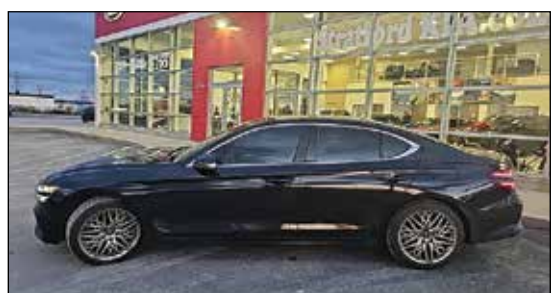
2022 Genesis G70 2.0T Advance

$42,995 + HST & lic All-Wheel Drive LOW KMS 20,887 km