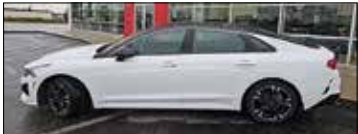
2022 Kia K5 GT-Line

$39,995 + HST & lic All-Wheel Drive LOW KMS 25,122 km