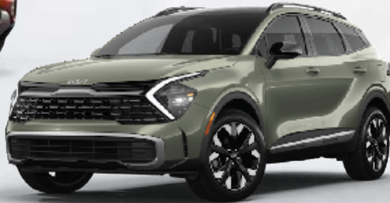
2023 Kia Sportage