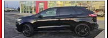
2022 Ford Edge ST Line

$43,995 + HST & lic All-Wheel Drive LOW KMS 22,127 km