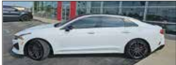
2022 Kia K5 GT

$43,995 + HST & lic Front-Wheel Drive LOW KMS 42,798 km