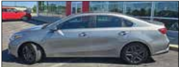
2021 Kia Forte EX

$27,995 + HST & lic Front-Wheel Drive LOW KMS 48,761 km