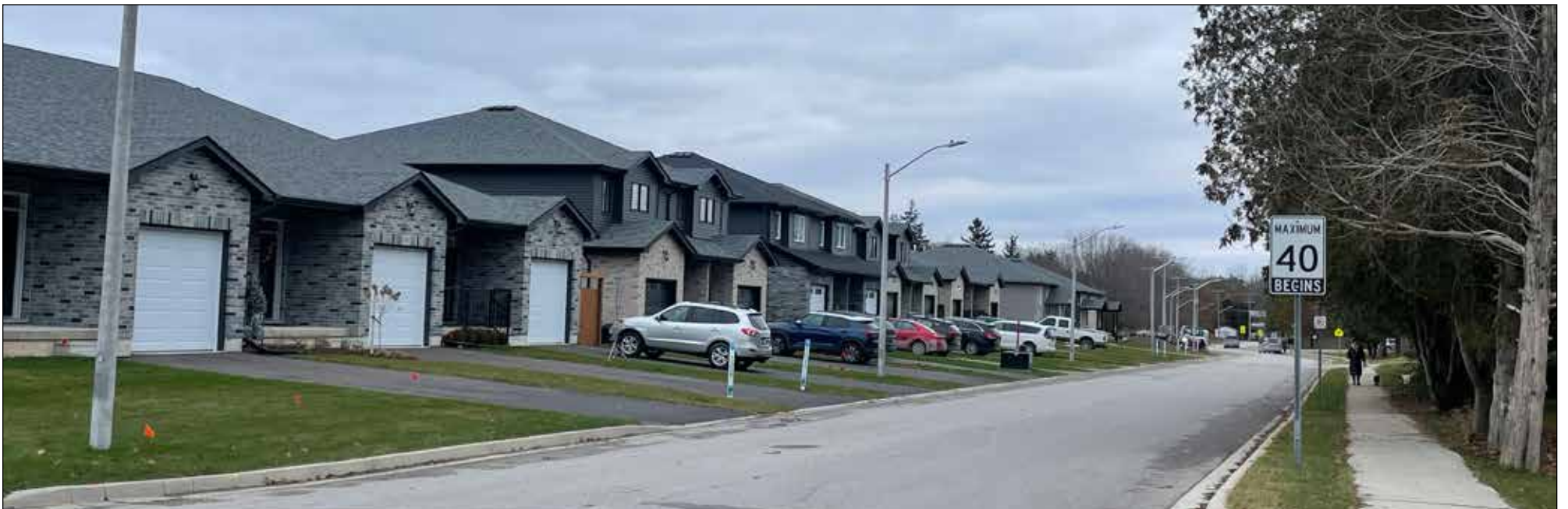
Looking east on Egan Avenue from Wellington Street North.