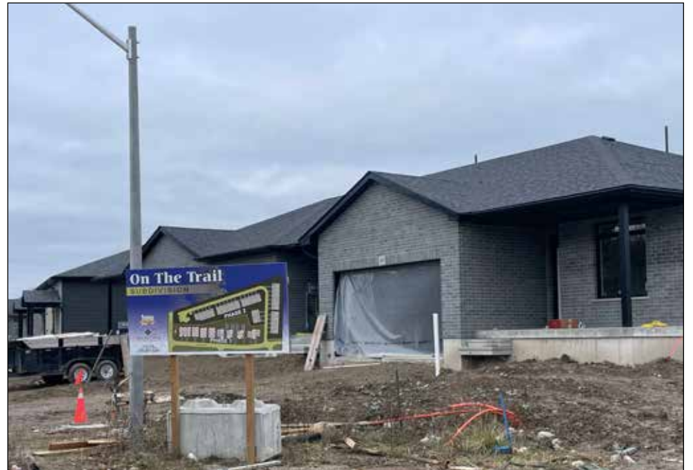
Phase 1 of the "On The Trail" subdivision on Egan Avenue was a busy area of construction in 2023