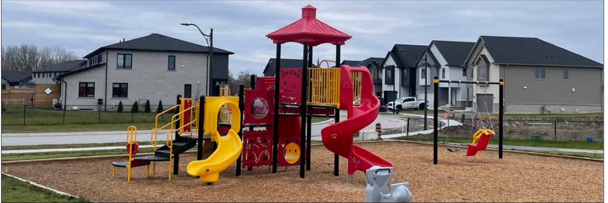
The Hooper Street / Trailside Avenue development continued to fill in during 2023. A new playground set was also added.