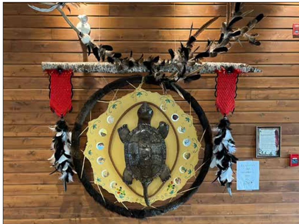
Significant symbols as part of the decor at the Native Canadian-owned and operated Hôtel-Musée Premières Nations in Wendake, Québec.