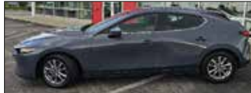
2022 Mazda Mazda3 GX

$28,995 + HST & lic Front-Wheel Drive LOW KMS 34,313 km