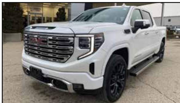
2024 GMC SIERRA 1500 DENALI