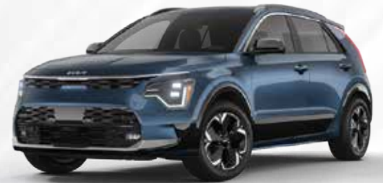
2024 Kia Niro EV