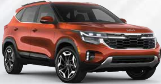
2024 Kia Seltos