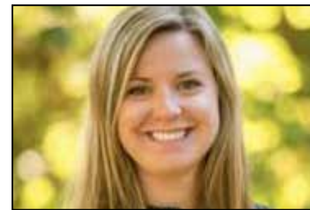
By AMY CUBBERLEY