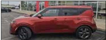
2020 Kia Soul EX

$24,995 + HST & lic Front-Wheel Drive LOW KMS 31,098 km