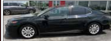
2022 Toyota Camry SE

$32,995 + HST & lic Front-Wheel Drive LOW KMS 36,995 km