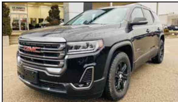
2023 GMC ACADIA AT4