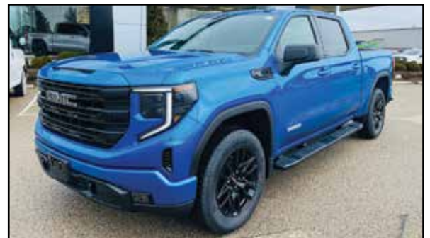
2023 GMC SIERRA 1500 ELEVATION