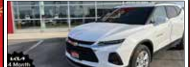
2020 Chevrolet Blazer

$38,995 + HST & lic True North All-Wheel Drive LOW KMS 11,504 km