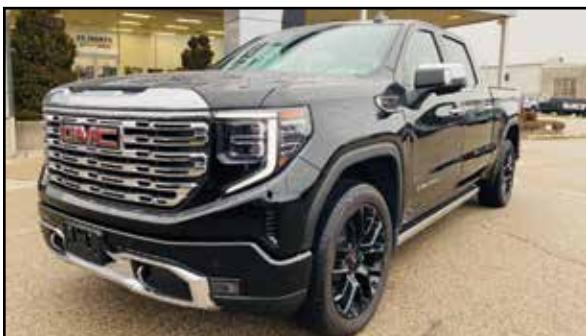
2023 GMC SIERRA 1500 DENALI