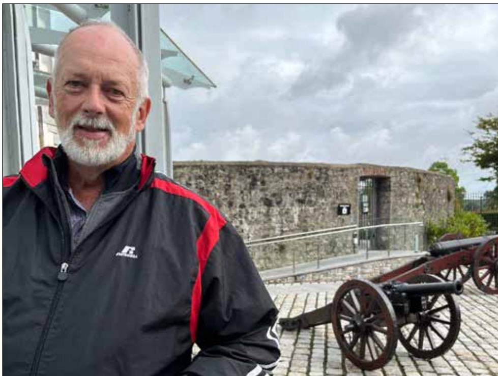
The author in the midst of Irish history.