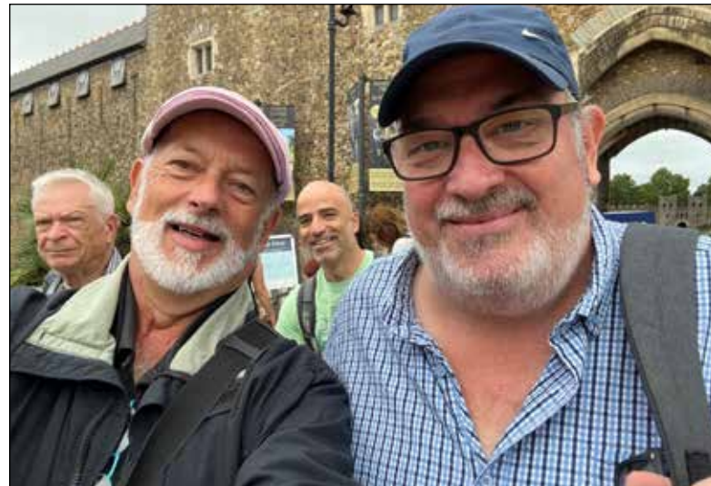
An international selfie at Cardiff Castle in Wales – four travellers, from four countries.

What about visiting places where we disagree with their political or social systems? Well, I really love to spend time in the Florida Keys. This, however, causes some internal turmoil because there is a lot of political stuff happening there that I find repugnant. So – should I go? The thing is, when I get there, I find local people who are equally disgusted with what is going on and often, those people are dependent on visitors like me for their livelihood. So I have to ask myself if refusing to visit certain areas impacts the leaders I distrust or does it only punish folks with whom I share common values?