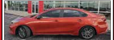
2022 Kia Forte GT-Line

$35,995 + HST & lic Front-Wheel Drive LOW KMS 36,425 km