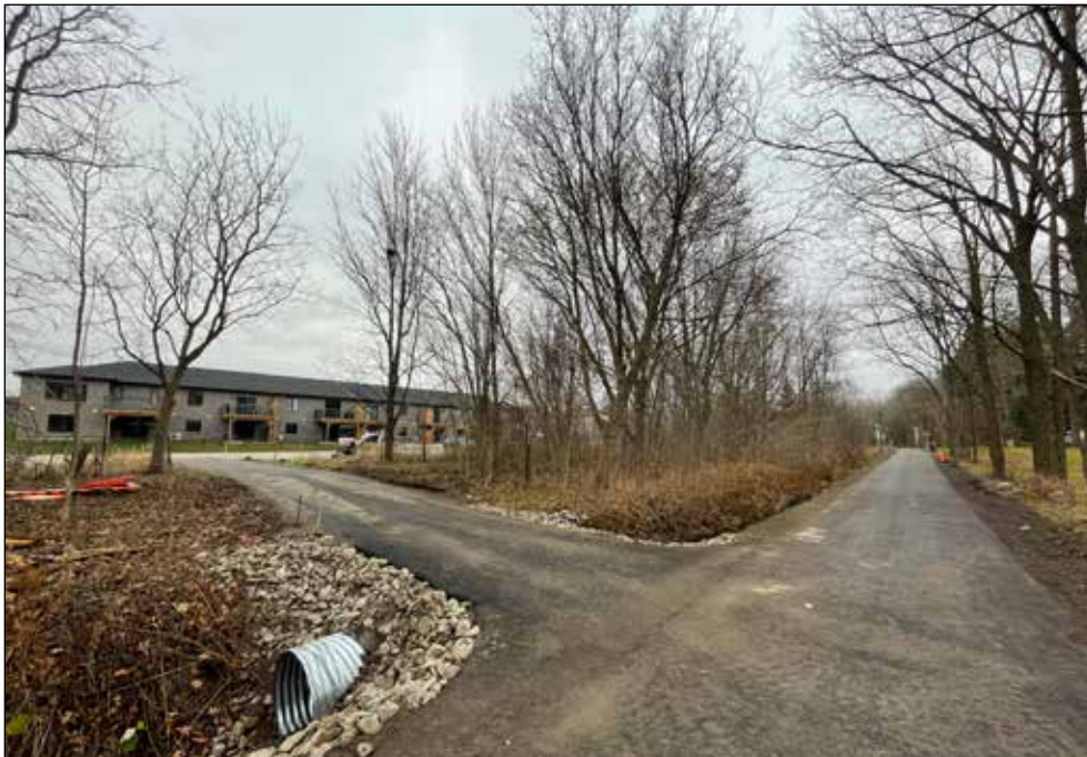
A large section of the Grand Trunk Trail (east from Wellington Street) was paved during the year. A new pathway provided access from the Hooper / Trailside neighbourhood.