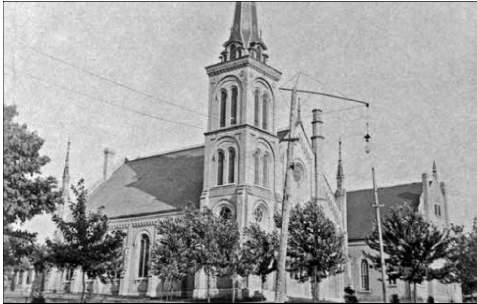
The St. Marys Methodist (United) Church in the early 1900s. The steeple on the tower was still intact at that time.