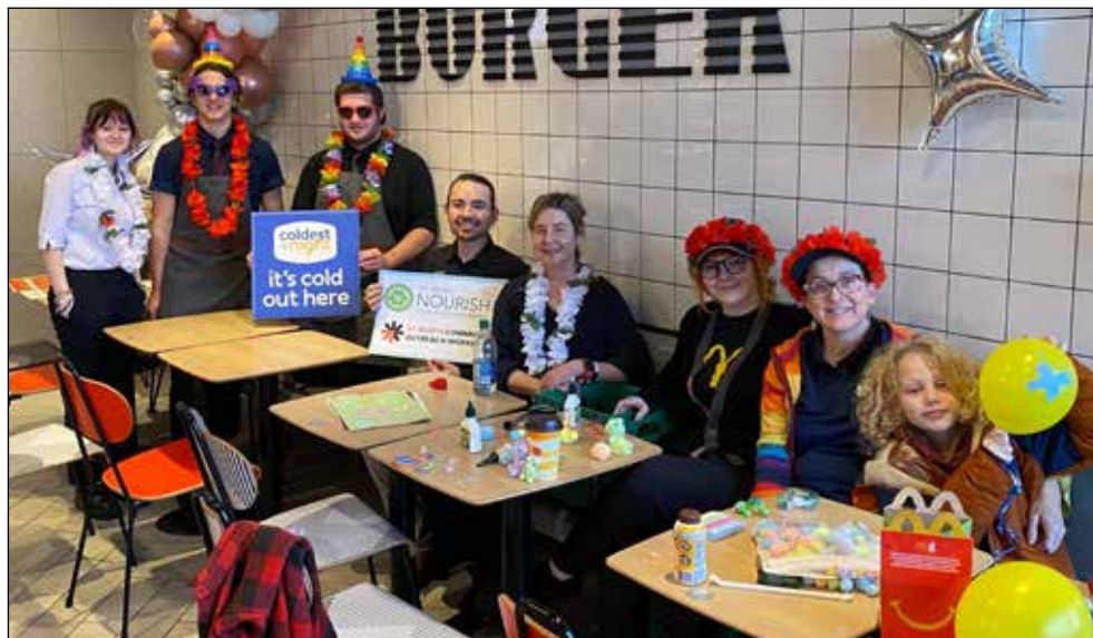
The friendly team at McDonald's celebrated the restaurant's first birthday on Saturday, January 28, 2023.