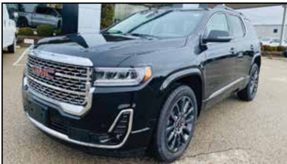
2023 GMC ACADIA DENALI