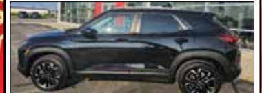
2021 Chevrolet Trailblazer LT

$34,995 + HST & lic Front-Wheel Drive LOW KMS 17,586 km