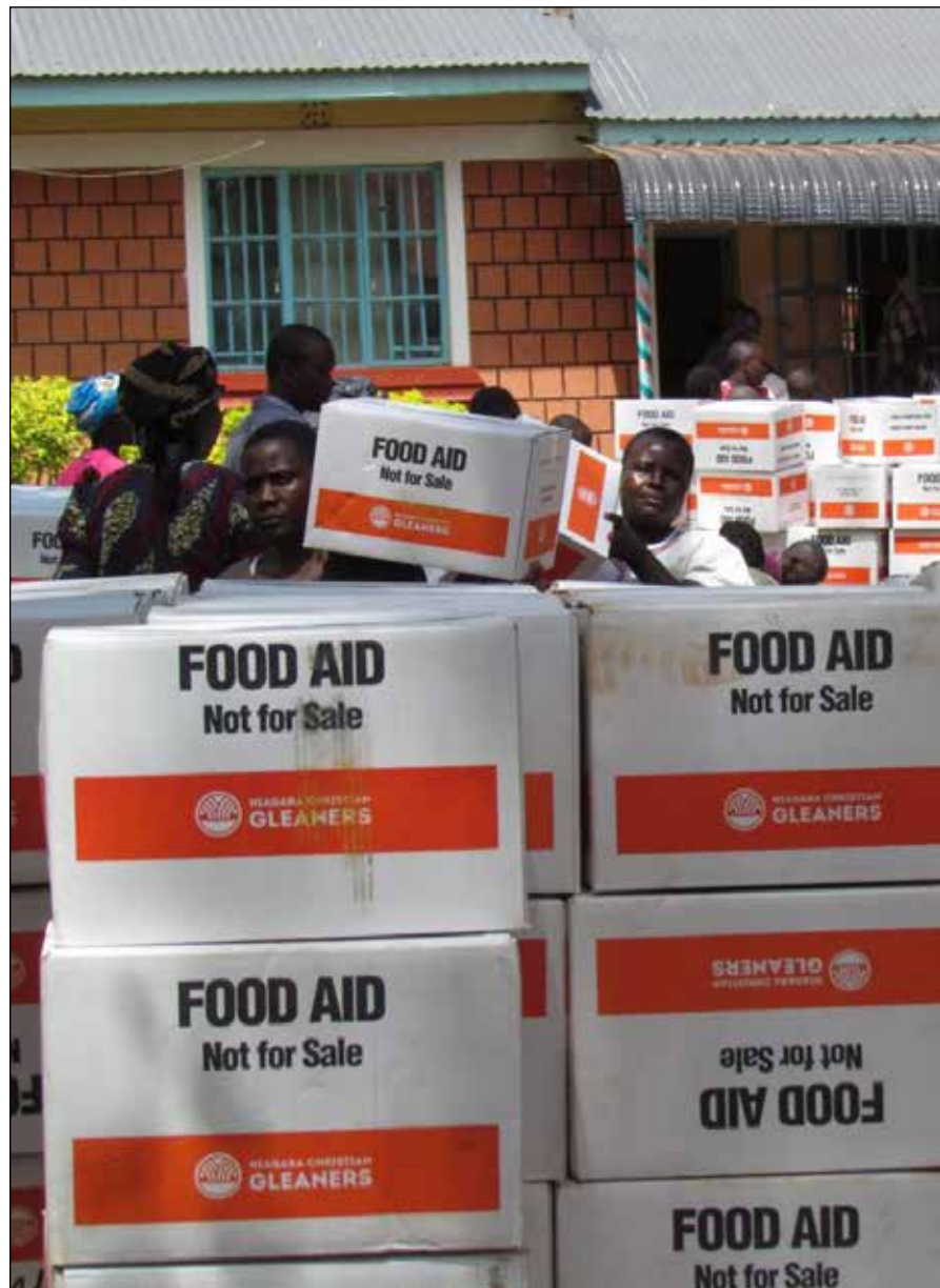
Several select aid agencies distribute the Niagara Christian Gleaners’ food to places in need.

“Our piece of the puzzle is transforming that produce into something safe and transportable.”