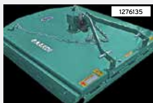
2024 Nardi Harvesting Rotary cutting, NBLSN Rotary cutter, Several sizes to choose from. $Call