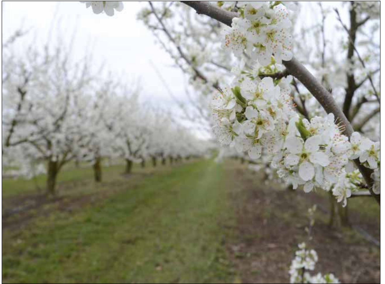
Heading into May, the blossoms were out on many trees at DeVries Fruit Farm in Fenwick.