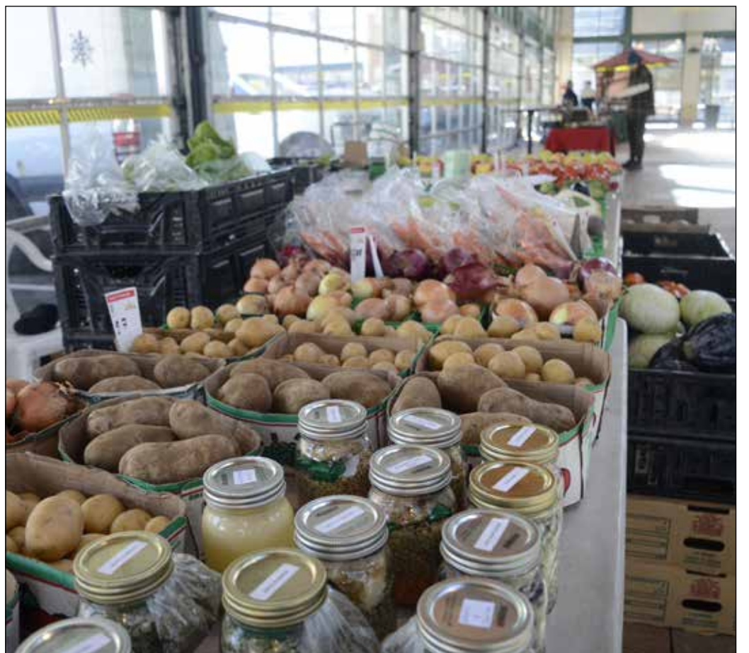
The St. Catharines Market will be expanding for the summer months beginning May 18.

Market Square is located downtown, at 91 King St. For more information visit stcatharines.ca .