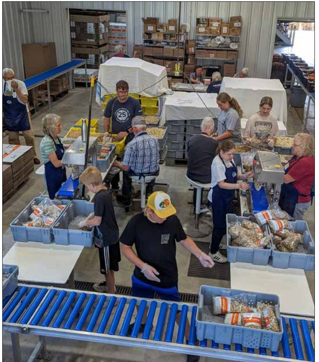
Niagara Christian Gleaners’ volunteer corps relies upon people of all ages.