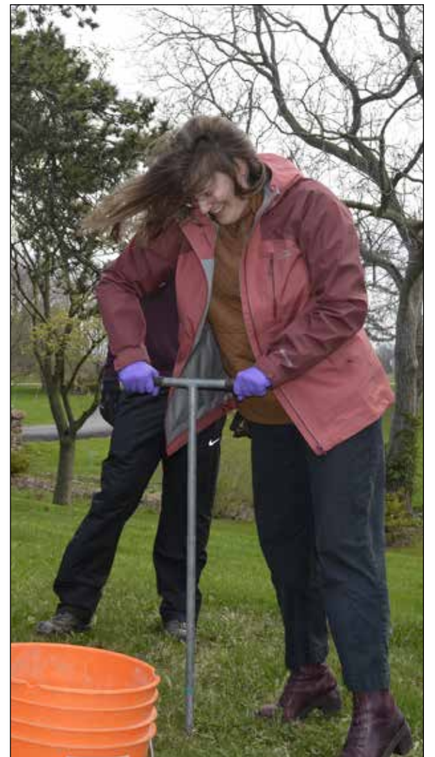
A member of the Greening the Landscape consortium puts all her muscle into getting a soil sample.

More information can be found at vinelandresearch.com , under the Innovation Program, Plant Responses and the Environment sub-heads. 🌿