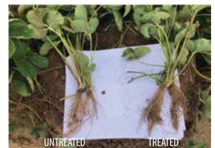
UNTREATED TREATED Strawberry Plants, Norfolk County