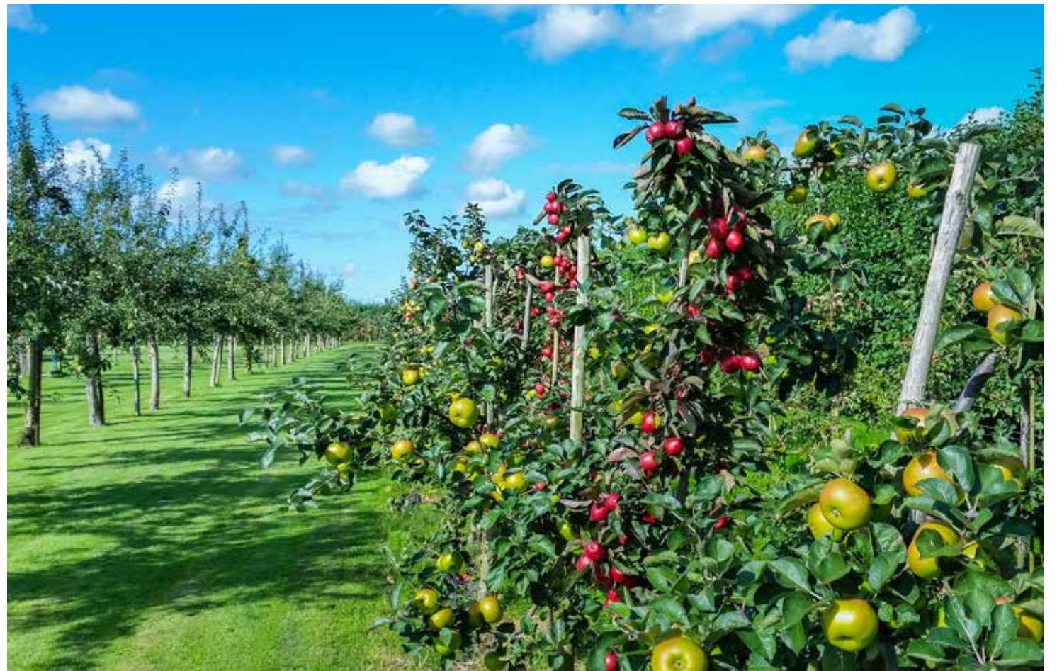
A study by Vineland Research and Innovation Centre has found fruit and vegetable growers have embraced sustainability measures.