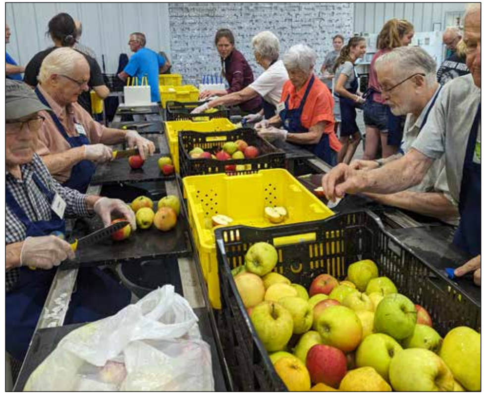
Volunteers handle the morning production from intake to bagging and storing the finished product. ~ Contributed photos

"It's an economical way to transform the growers' produce," Wierenga explained.