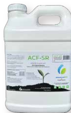
Liquid Bio-Fertilizer Supplement Trickle or BroadCast Applications