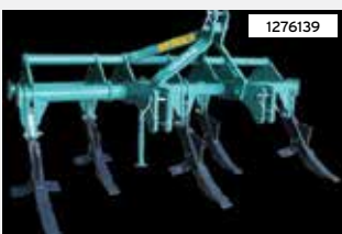
2024 Nardi Harvesting Prince 300-7 Chisel Plow, Prince 300-7 Chisel plow. Double spiked & quick release. $Call