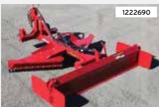
2022 WIL-BE G8-2300 Grader, Smart surface tools driveway grader. $19,750