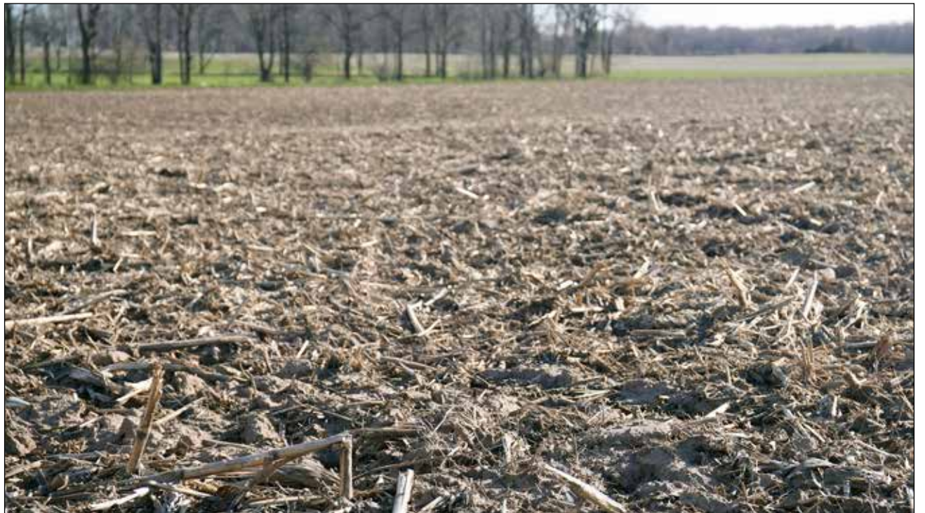
'Be prepared' for a variety of weather is the best advice for Ontario farmers looking forward to getting crops in the ground and pushing them on through to harvest.

for southern Ontario farmers facing the 2024 growing season.