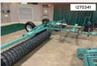
2024 Nardi Harvesting CAMBRIDGE Packer, BRAND NEW sprocket packer 24' narrow transport width $33,000