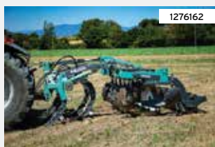
2024 Nardi Harvesting Fast Gladiator, Combi ripper disc. Several sizes available. $Call

TRACTOR RENTALS. AVAILABLE DAILY, WEEKLY, MONTHLY. CALL TODAY FOR ALL YOUR EQUIPMENT RENTAL NEEDS. SERVING SOUTHERN ONTARIO AND BEYOND