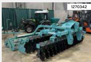
2024 Nardi Harvesting ORBIS 4m Disc, 4m rigid frame highspeed disc, 3pt or trailed version avail $Call