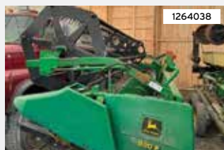
2000 John Deere 920F Header - Flex, good condition header, lots of new knives and guards, $7,500