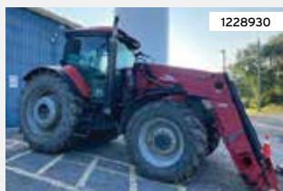
2009 McCormick TTX230 Tractor, 4000 hrs, 213HP, With loader, 32 speed transmission, 3 sets of remotes 213hp $79,999