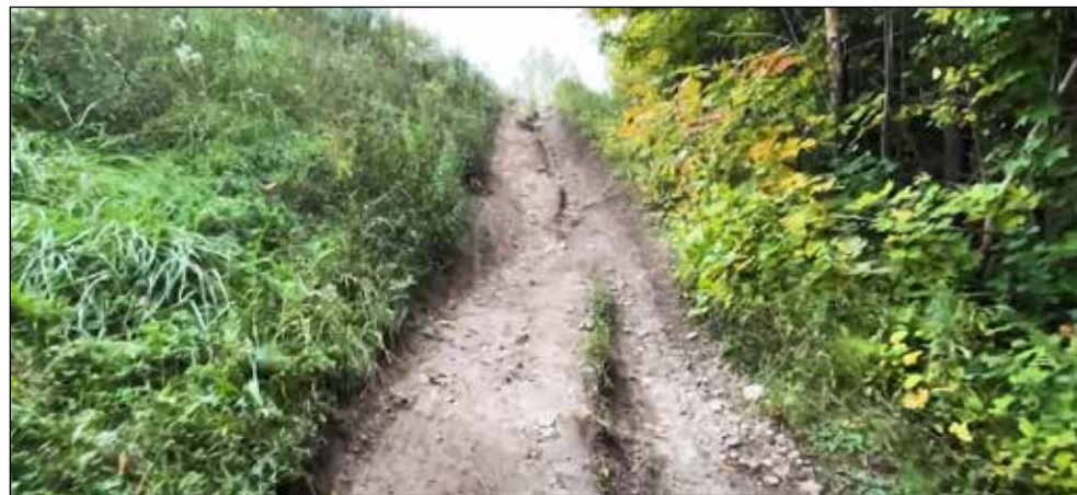
Below: A current pic of what was once the Blyth Tunnel.