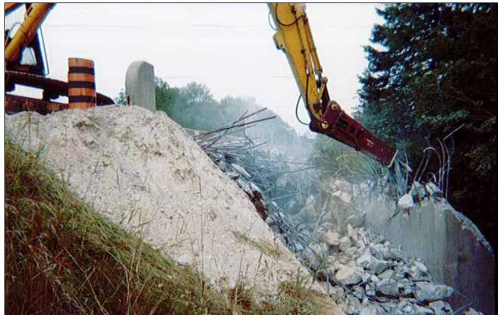
Above: The Blyth Tunnel being filled in.

According to Hall, as of Sept. 29 no work has commenced on restoring the bridge and tunnel yet as the G2G Rail Trail Inc. is still in the fundraising stage of the project.