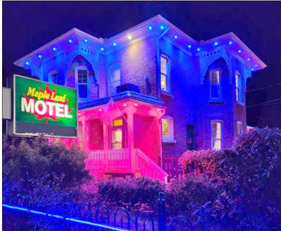
Maple Leaf Motel in Goderich

These British children were considered inferior and stigmatized as such because they were poor and needed help. These children were often taunted and made