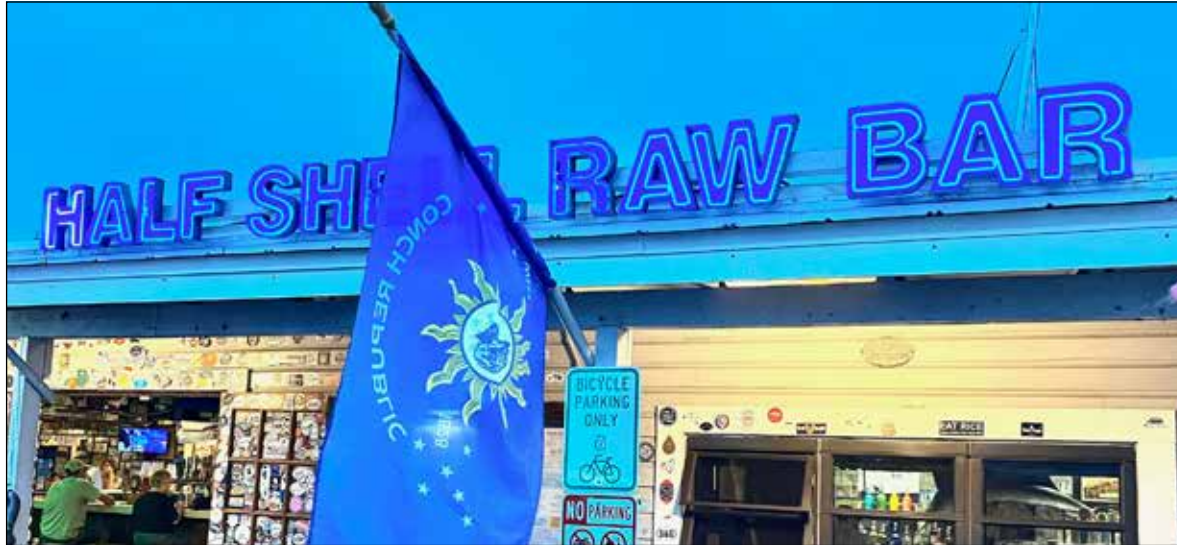
The quirky, unique Half Shell Raw Bar on Key West's historic waterfront.