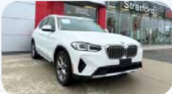
2022 BMW X3

$ 39,998 + HST & lic LOW KMS - 71,776 KM