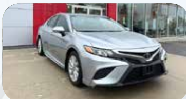
2020 Toyota Camry SE

$ 27,998 + HST & lic LOW KMS - 63,739 KM