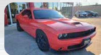
2021 Dodge Challenger R/T

$ 48,898 + HST & lic LOW KMS - 15,119 KM