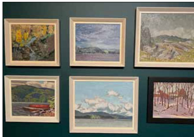
A wall full of paintings by Group of Seven member A.J. Casson.