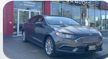
2017 Ford Fusion SE

$ 13,998 + HST & lic LOW KMS - 164,564 KM