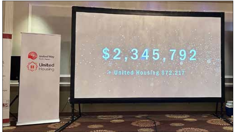
The United Way Perth-Huron celebrated a record-breaking year for fundraising at its Spirit of the Community celebration March 21, announcing it had raised more than $2.3 million through its 2023-2024 campaign.

United Way also praised its sponsors including Best Western Plus, The Arden Park Hotel (the Hayter Family), Chartwell Anne Hathaway Retirement Residence, Famme & Co., Horizon Solutions, KDB Law, RE/MAX a-b Realty, IATSE Local 357, investStratford, Samsonite, SBS Metals and the Stratford Festival.