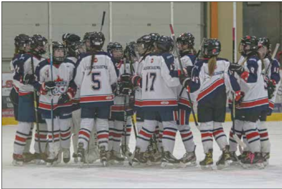
The U15 C Girls St. Marys Rock secured their spot in the division finals with an overtime, 3-2 win against the Woodstock Wildcats March 24.

"Of course, our leaders did a great job again holding us together and driv-