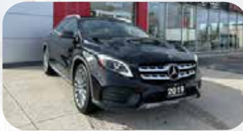
2019 Mercedes GLA-250

$ 28,395 + HST & lic LOW KMS - 87,492 KM