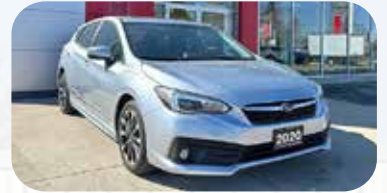
2020 Subaru Impreza

$ 26,898 + HST & lic LOW KMS - 29,594 KM