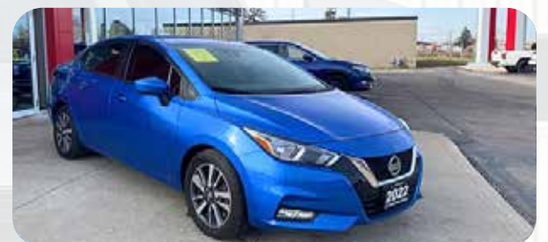
2022 Nissan Versa

$ 21,898 + HST & lic LOW KMS - 21,401 KM