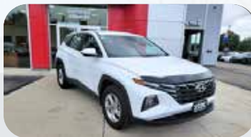
2022 Hyundai Tucson AWD

$ 31,899 + HST & lic LOW KMS - 21,910 KM