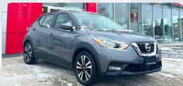
2020 Nissan Kicks SV

$ 20,898 + HST & lic LOW KMS - 47,564 KM