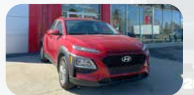
2019 Hyundai Kona

$ 20,495 + HST & lic LOW KMS - 52,086 KM