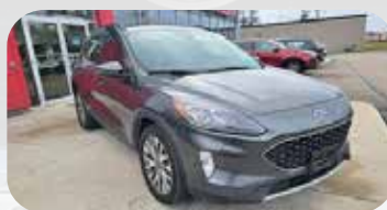
2020 Ford Escape Titanium

$ 32,898 + HST & lic LOW KMS - 10,215 KM