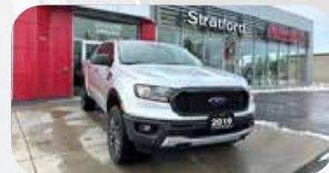
2019 Ford Ranger Supercrew

$ 33,898 + HST & lic LOW KMS - 80,655 KM