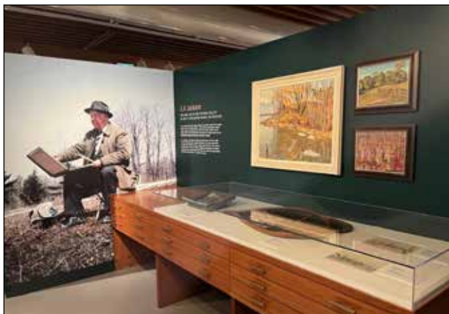
The A.Y. Jackson corner at the Ottawa Art Gallery includes Jackson paintings, drawers full of his sketches and his snowshoes and palette box.