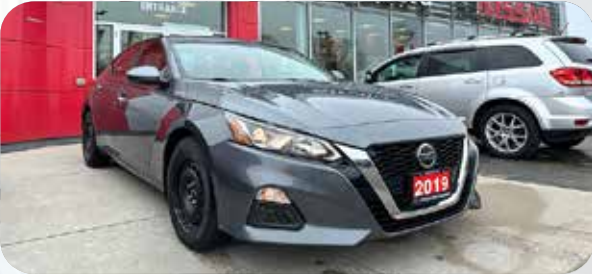
2019 Nissan Altima

$ 19,395 + HST & lic LOW KMS - 95,446 KM